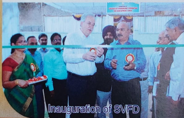
Inauguration of SVFD

H:No. 2-6-41/75; Plot No. 75, Sathsang Colony, Upperpally, Rajendranagar, Hyderabad - 500 030. Telangana, India. Phone : 040-20020687, Mobile No : 9440051598 E-mail : sarvareddy@yahoo.com; svfd2013@gmail.com